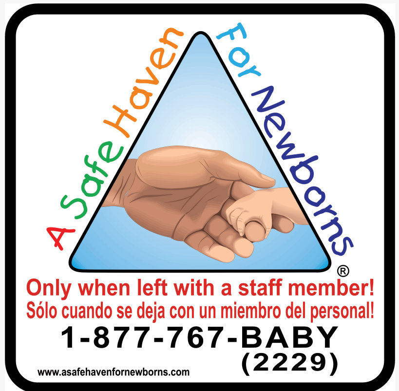
A Safe Haven for Newborns Signage designating hospitals, fire and EMS stations as Safe Haven.