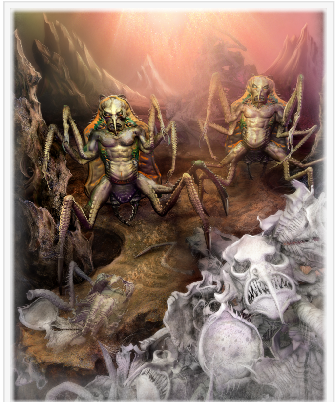
Firewalkers of Hell's Hearth are a deadly and unavoidable risk when traveling from Western Oz to The Emerald City