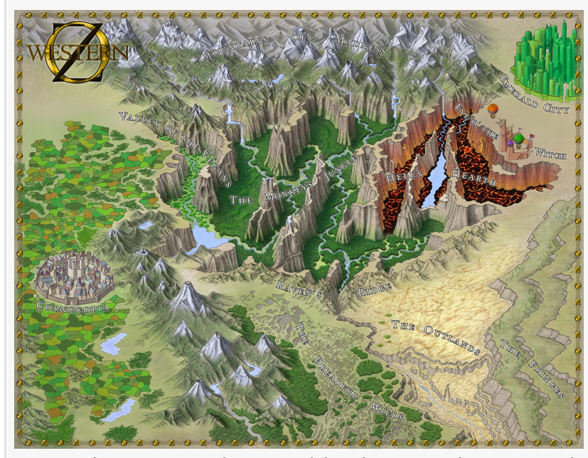
Original Art - Wizard Was Odd Trilogy, Book Two: Trail of Tears, (Wizard of Oz from Toto's Perspective)

This press release can be viewed online at: http://www.einpresswire.com