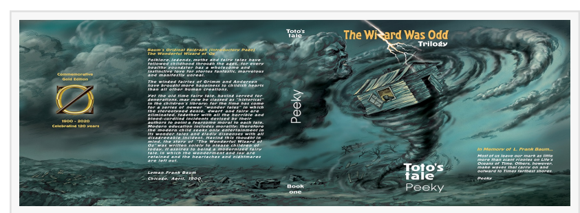
Dust Jacket and Cover for Toto's Tale, a Limited Edition

TAMPA, FL, UNITED STATES, April 13, 2020 /EINPresswire.com/ -- In 450 pages, Toto tells the reader like it is. "For 120 years, every monkey and his uncle who was smart enough to hold the sharp end of a pencil to paper, has shared their version of 'the yellow brick