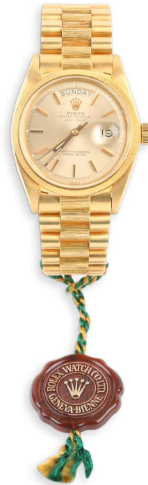
18kt gold Rolex men's day-date President watch, ref. 1807, made circa 1973 (est. CA$10,000-$12,500).