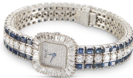
Gorgeous circa 1990 Piaget 18kt diamond and sapphire watch, ref. 8480 H69 (est. CA$80,000-$100,000).