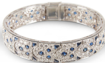
Cartier 18kt diamond and sapphire Arcadie bracelet with 140 diamonds and 75 sapphires (est. CA$30,000-$50,000).

Easily the auction's headliner in terms of high pre-sale estimates is a stunning 11-carat platinum