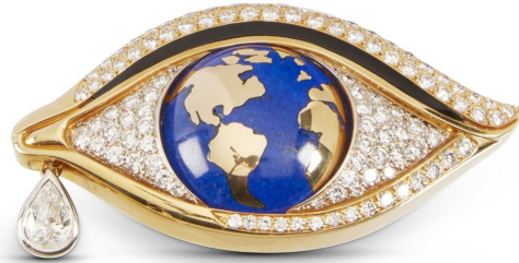
Mia Brattan 18kt diamond, onyx, lapis lazuli eye-shaped brooch with 100 round brilliant cut diamonds (est. CA$8,000-$12,000).

This press release can be viewed online at: http://www.einpresswire.com