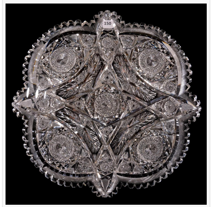
Brilliant Period Cut Glass round tray signed by Libbey, in the Diana pattern, 15.75 inches in diameter ($17,000).