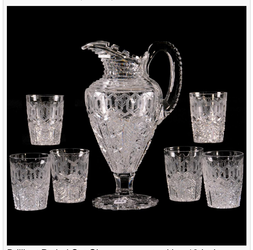
Brilliant Period Cut Glass water set, with a 12-inch pitcher in the Pedestal Alhambra pattern by Meriden ($8,000).