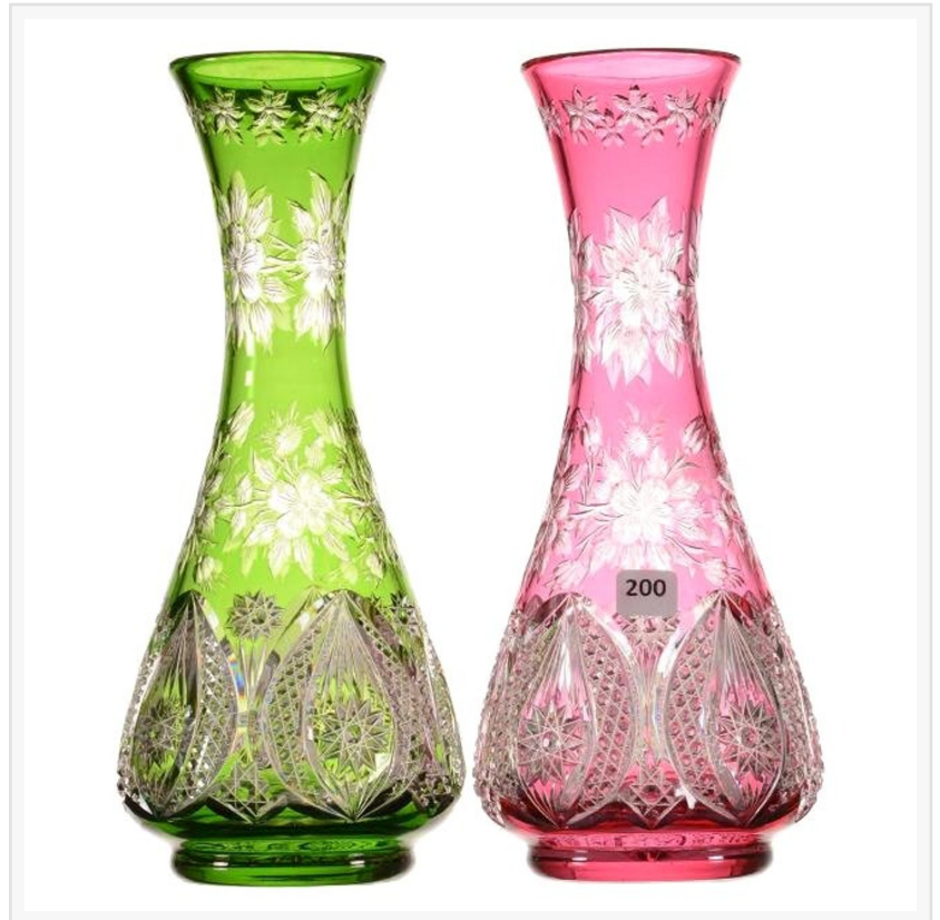
Pair of Brilliant Period Cut Glass vases by Dorflinger -- one cranberry and one green, both cut to clear ($14,500).

Round trays by Hawkes were a hit with bidders. An 11-inch-diameter example in the Panel pattern with exquisite blank and cutting, went to a determined bidder for $5,000; while one in the Lattice and