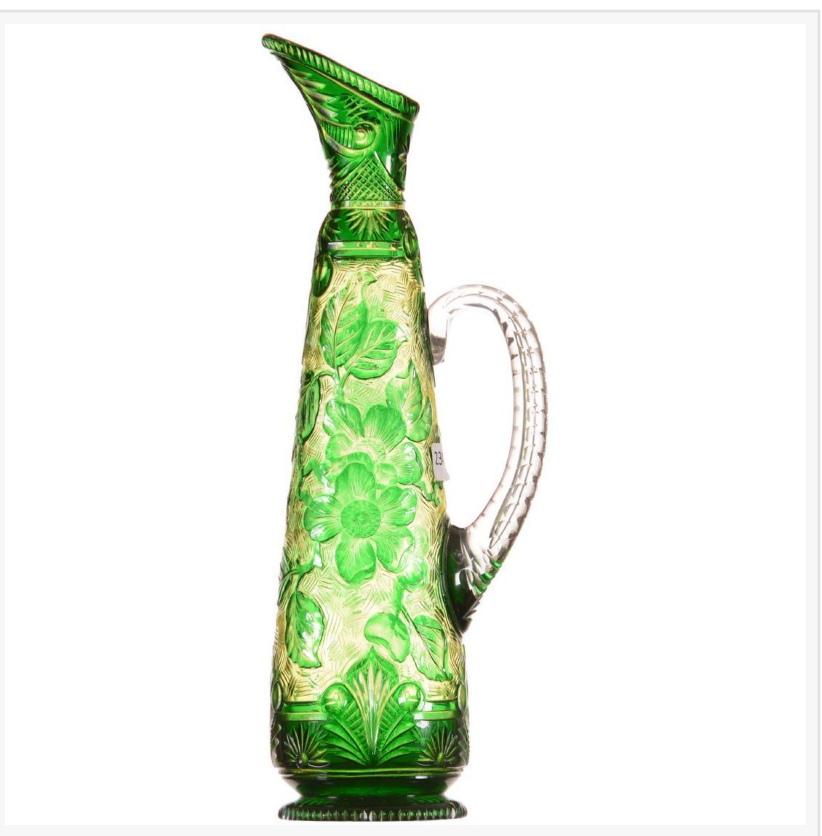
Brilliant Period Cut Glass emerald green cut to yellow tankard with a fabulous wheel carved floral design, 14.25 inches tall ($6,500).