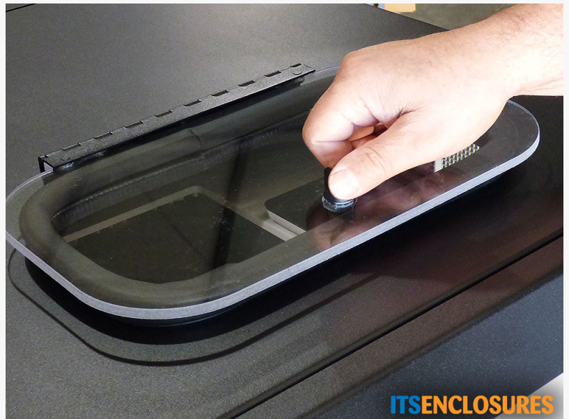
Add an optional hinged printer door to the top or bottom of the enclosure.