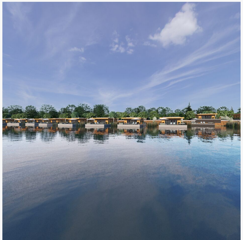
.... and first of its kind in the UK!