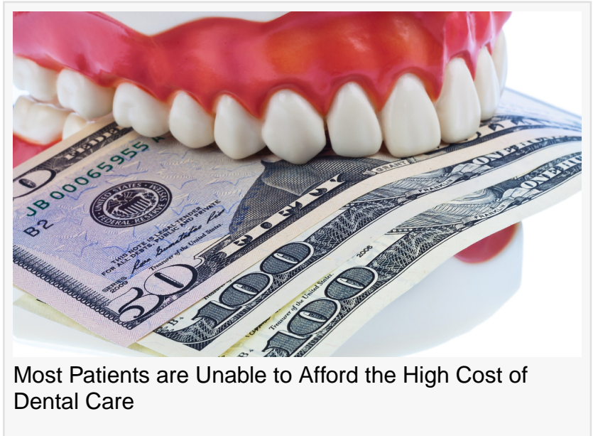
Most Patients are Unable to Afford the High Cost of Dental Care

MIAMI, FLORIDA, UNITED STATES, April 23, 2018 /EINPresswire.com/ -- Have you been to the dentist lately? If not, you may be in for a surprise. A visit to the local dentist is becoming too expensive for most Americans. While prices for routine check-ups and cleanings are reasonable, prices for dental implants, crowns and full mouth restorations have reached stratospheric heights. Across the USA, dental implants are priced at $1900-$2500. In some markets, a dental implant can cost as much as $4000. Add a crown to the dental implant and the price almost doubles.