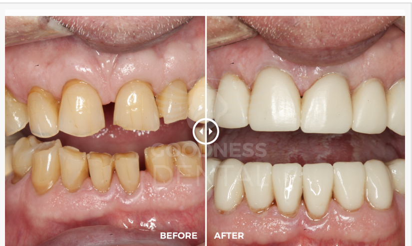
Before & After: Full Mouth Restoration in Guatemala

5.Compassionate Care: While many patients in US dental clinics receive scant little time with their