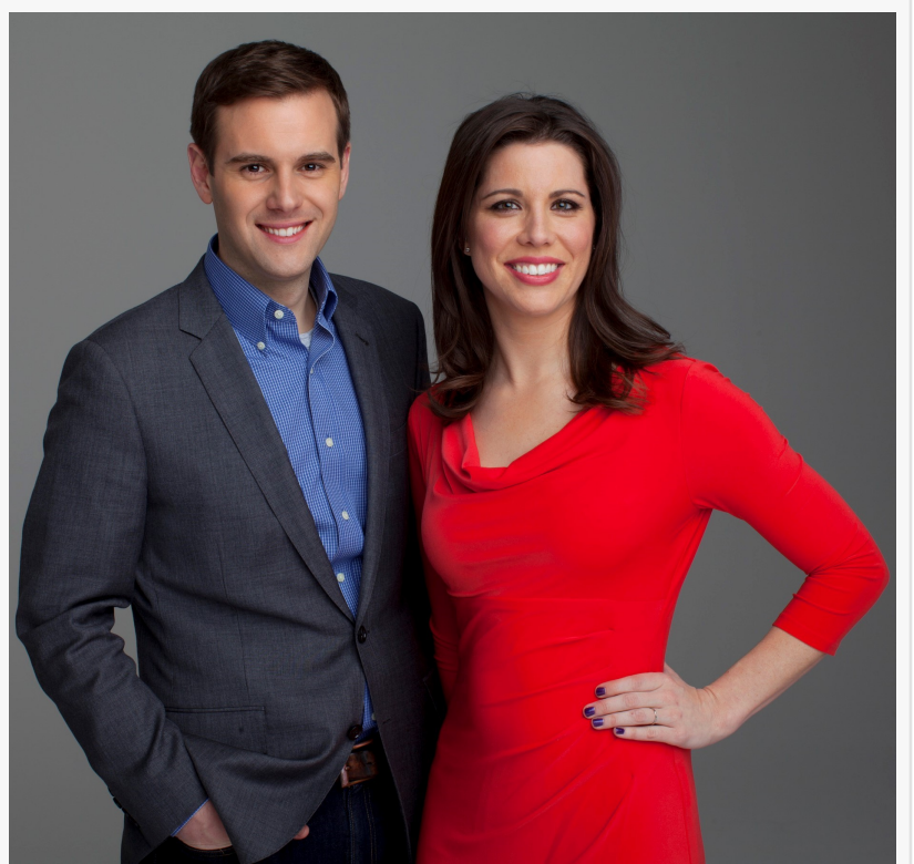
Guy Benson and Mary Katharine Ham

This press release can be viewed online at: http://www.einpresswire.com