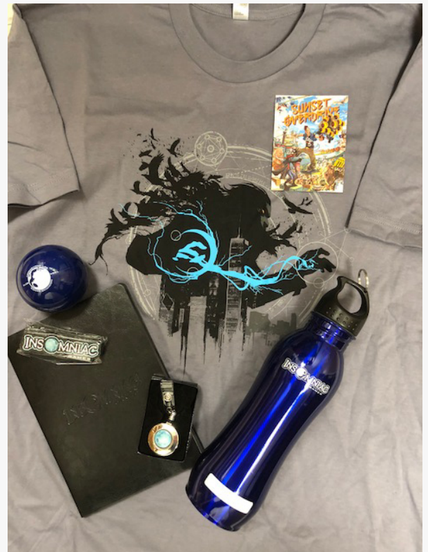
Insomniac Games tshirt and swag