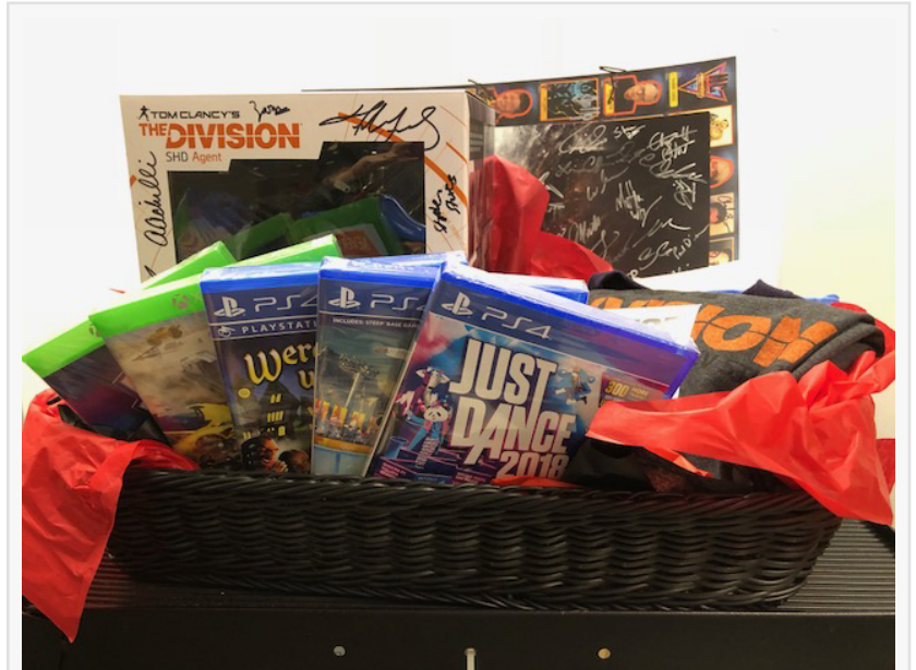
Red Sstorm Entertainment Gift Basket, with games, autographed dev team posters, t-shirts and more

RALEIGH, NC, USA, April 17, 2018 /EINPresswire.com/ -- The Child's Play charity raffle returns to East Coast Game Conference Child's Play, a charity that seeks to improve the lives of children in pediatric hospitals, returns to East Coast Game Conference, April 17-19, 2018. The raffle benefits Chapel Hill's UNC Children's Hospital. Their booth, located on the expo floor across from Wake Tech's Simulation & Game Development program , will be selling raffle tickets during the show hours. Prizes, donated by local game companies, include video games, collectibles, and other swag. Daily drawings will be held ½ hour before closing.