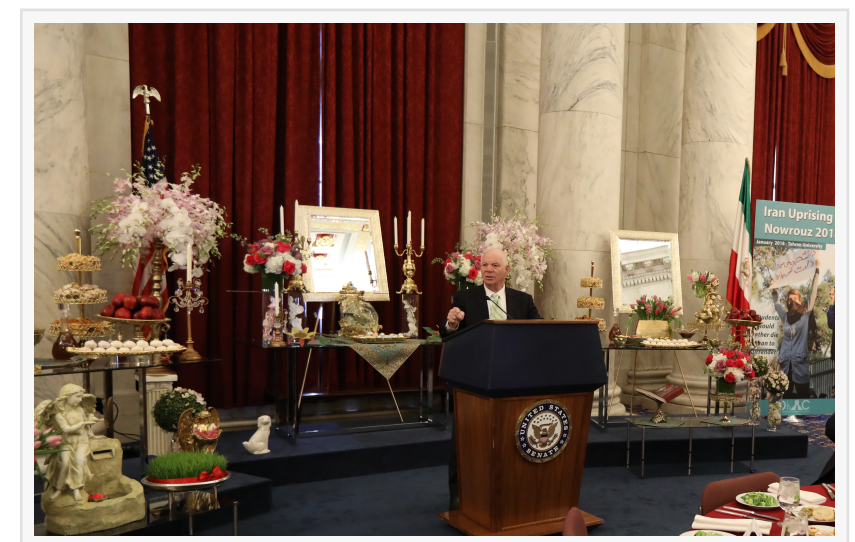
Senator Ben Cardin (D-MD)