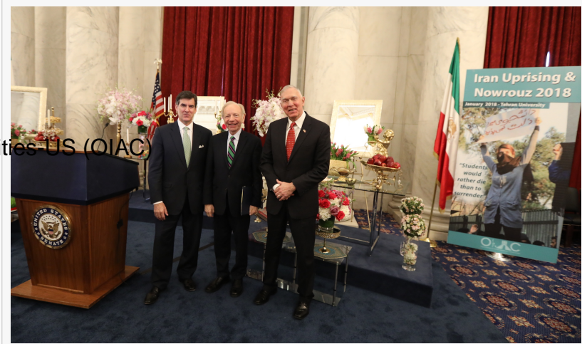
Senator Liberman, General Conway, Ambassador Reiss

This press release can be viewed online at: http://www.einpresswire.com