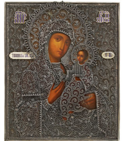
Russian icons will include The Virgin of Kazan and The Virgin of Tikhvin, both shown here.