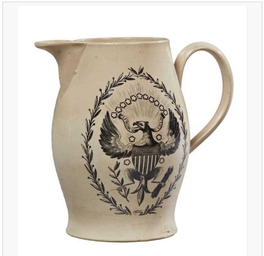
Lovely and superb Liverpool creamware pitcher (or jug), circa 1795-1818, 6.5 inches tall.