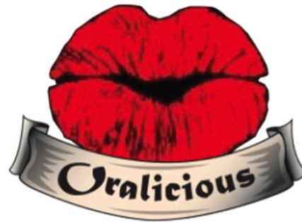
Oralicious Logo Design

http://www.barnesandnoble.com/w/oralicious-tatiana/1125193866?ean=9781504368247