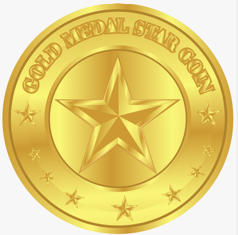
Gold Medal Star Blockchain Token