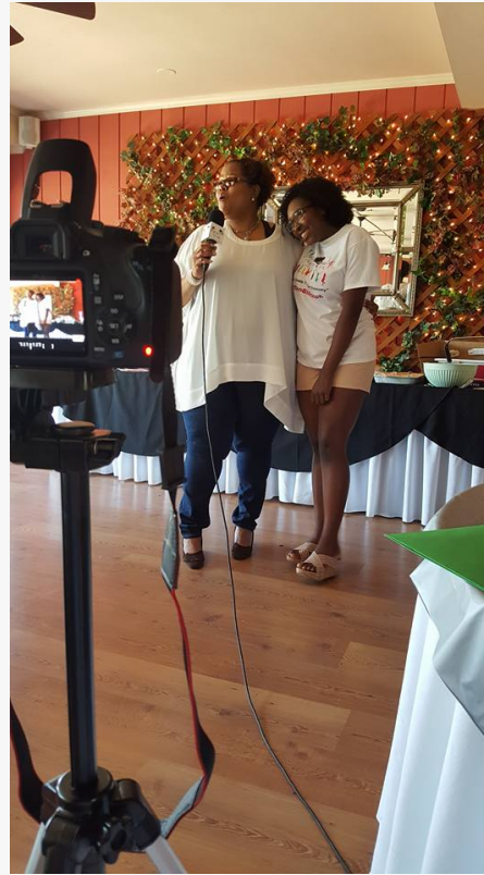
Teen Girl Speaks about her YouTube Channel on Beauty, MakeUp, & Loving her Natural Coily Hair

We're living in a generation removed from real time hugs and would rather drop you an emoji when you're reaching out for human interactions. Oppose to always being plugged in - our workshops take