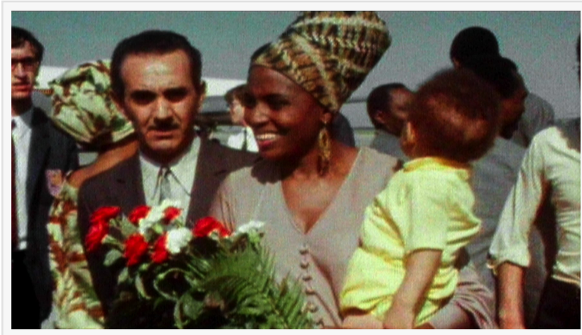
Mama Africa: Miriam Makeba