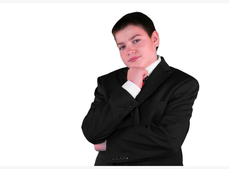
Austin Really Twin