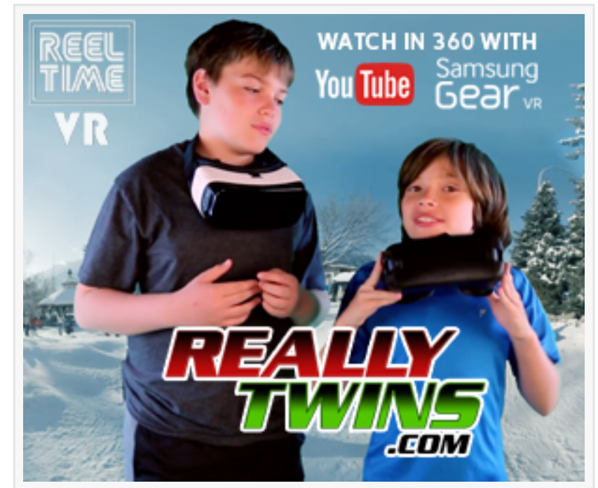
Really Twins NFL