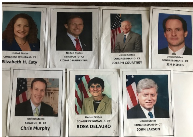
Political Cronies of Connecticut-Based Connstep, Inc.

investigate the organization for corporate bribery, defrauding taxpayers, violating anti-competitive laws, and corporate cronyism involving numerous Connecticut lawmakers.