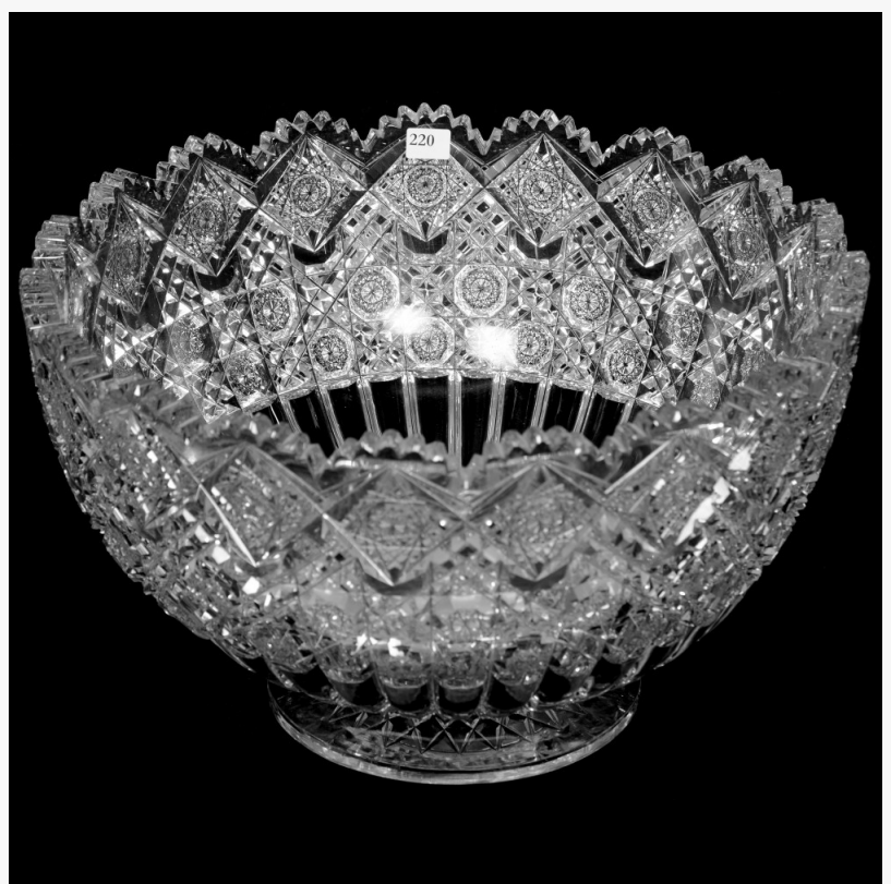
Fantastic ABCG pedestal punch bowl in the Stars and Stripes pattern by Sinclair ($14,000)

After that, Woody Auction's 2018 lineup will include an antique auction on Saturday, March 10th; a cut glass auction on Saturday, March 24th, an antique estate auction on Saturday, April 28th; and a major cut glass auction on Saturday, May 12th, at the St. Charles Convention Center in Missouri. A July auction is also planned. Woody Auction is currently filling auction dates from August to December, 2018.