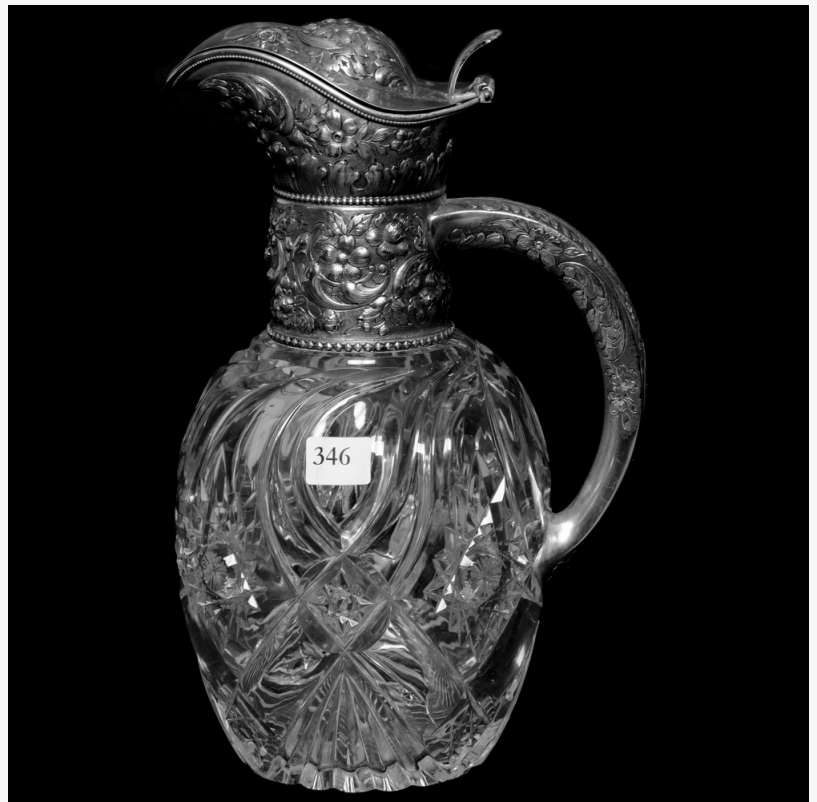
10.25-inch-tall ABCG claret jug in a hobstar, swirled tusk, clear bar and fan motif ($9,000).