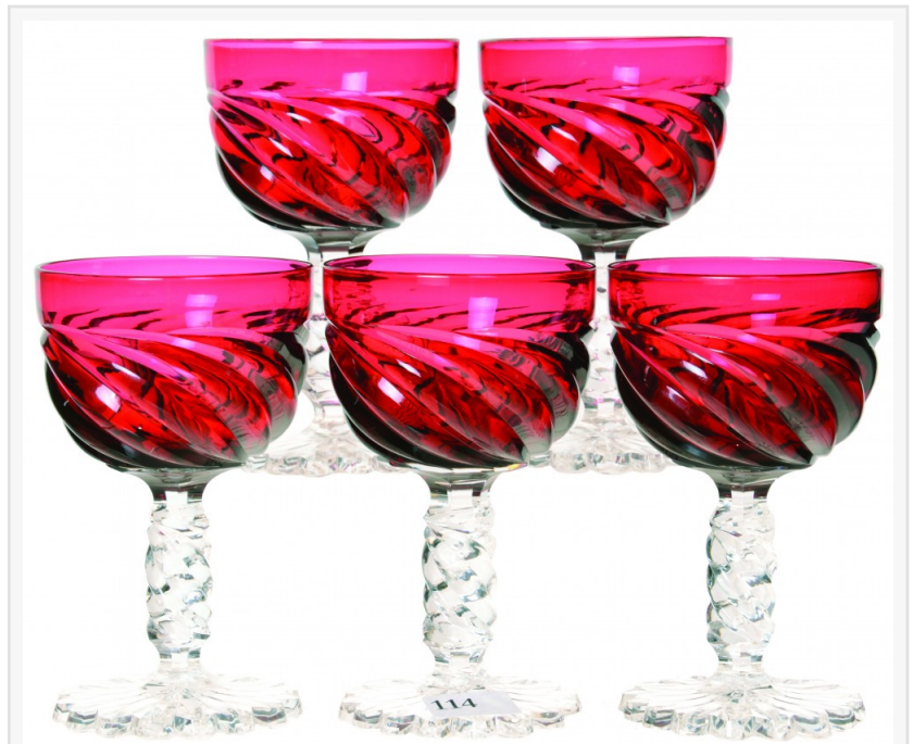
Five solid cased ruby ABCG wine glasses in a spiral pattern by Dorflinger ($27,500).

A set of four claret (red table wine) ABCG glasses in the Wedgemere pattern by Libbey, each one five inches tall and with a scalloped hobstar petticoat base and extra nice blanks, finished at $13,000. Also, a 10 ¼ inch tall ABCG claret jug in a hobstar, swirled tusk, clear bar and fan motif, comprising a fine Gorham sterling repousse spout, lid and handle, an example of the highest quality, breezed to $9,000.