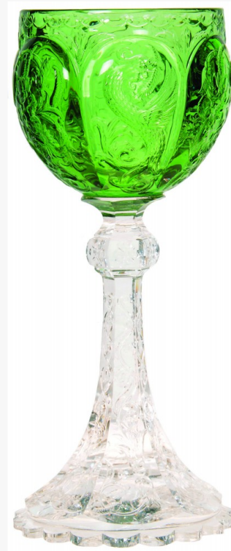
Solid green Rhine wine glass, Webb Rock crystal, with dragon and floral motif ($9,500).