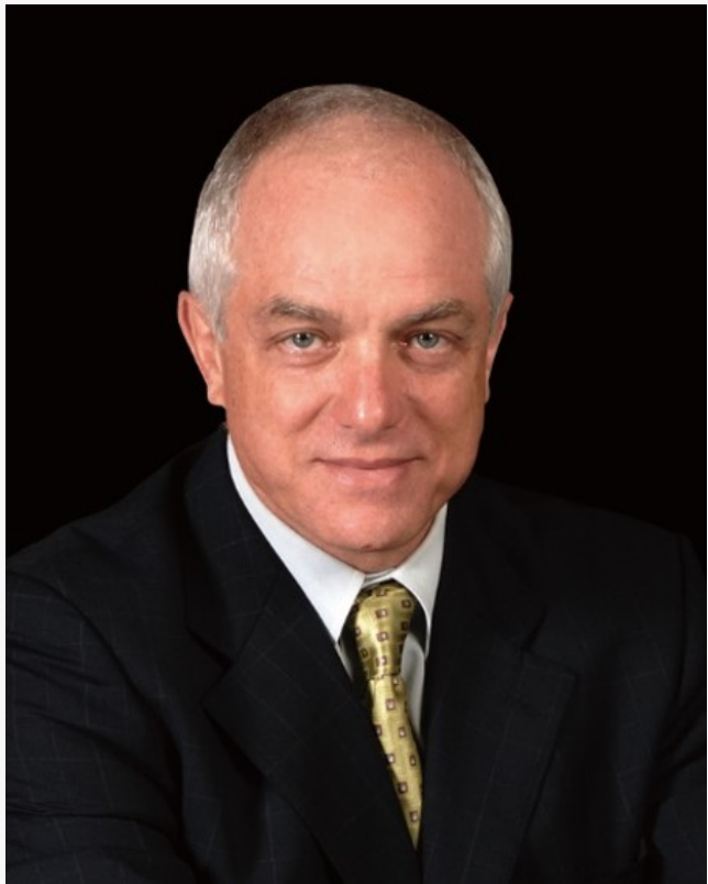
Chairman and Executive Director of Global Alliance Partners