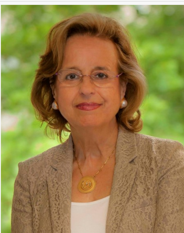
Chairperson of GVC Gaesco

GVC Gaesco offers a large group of products and services in Wealth Management and Private Banking, Brokerage and Custody, Corporate Finance and Capital Markets, Research and Insurance Brokerage. It is CNMV Registered Entity under number 182. Member of Barcelona, Madrid, Valencia, Paris, Amsterdam, Brussels, Lisbon and Frankfurt Stock Exchanges. MEFF, AIAF, Iberclear and Euroclear custodian and clearing Member. Entity Delegated by the Bank of Spain. MAB and MARF Registered Advisor. Founding partner and member of the European Securities Network (ESN).