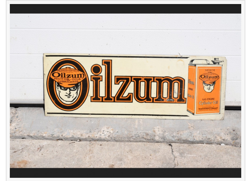
Oilzum Cylinder Oil horizontal sign with great graphic, 10 inches by 28 inches.

Route 32 Auctions is located at 1705 Lebanon Road in Crawfordsville, Indiana, where it has a 20,000-square-foot showroom that's open Monday thru Friday, from 9-5 Eastern time, as well as Saturday and Sunday (and car clubs) by appointment. There, visitors can purchase petroliana and other items at a fixed price. Crawfordsville is located about 35 miles outside of Indianapolis, Ind.