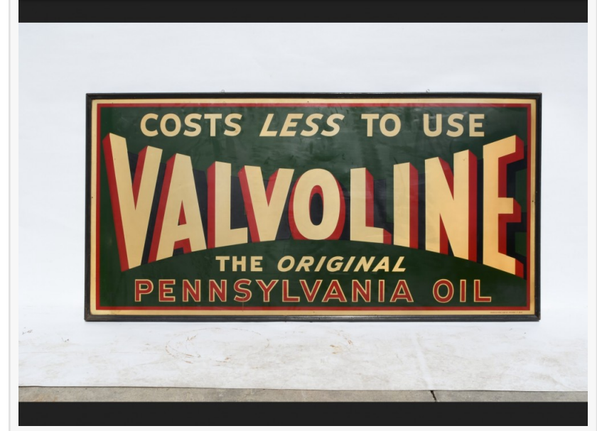
Valvoline "Cost Less to Use" horizontal tin sign, rare, in the original wooden frame.

Christy's of Indiana, the auction venue, is located at 6851 Madison Avenue in Indianapolis. The firm conducts public auctions every Wednesday morning at 9 am. These "market day" events feature six auction rings, selling various items such as antiques, glassware, art, new and used furniture, tools, jewelry, TVs, electronics, coins, farm and fleet, box lots, store returns and more.