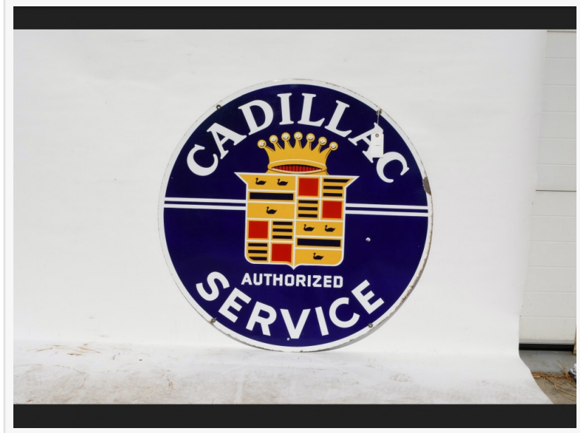
Cadillac "Authorized Service" sign, marked Walker & Co. (Detroit).

Other double-sided porcelain signs will feature a Marathon Products "Running Man" sign with good color and average gloss, showing the early Marathon colors and logo, measuring 48 inches square; and a Cadillac "Authorized Service" sign marked "Walker & Co." (Detroit), with some chipping in the fields on both sides