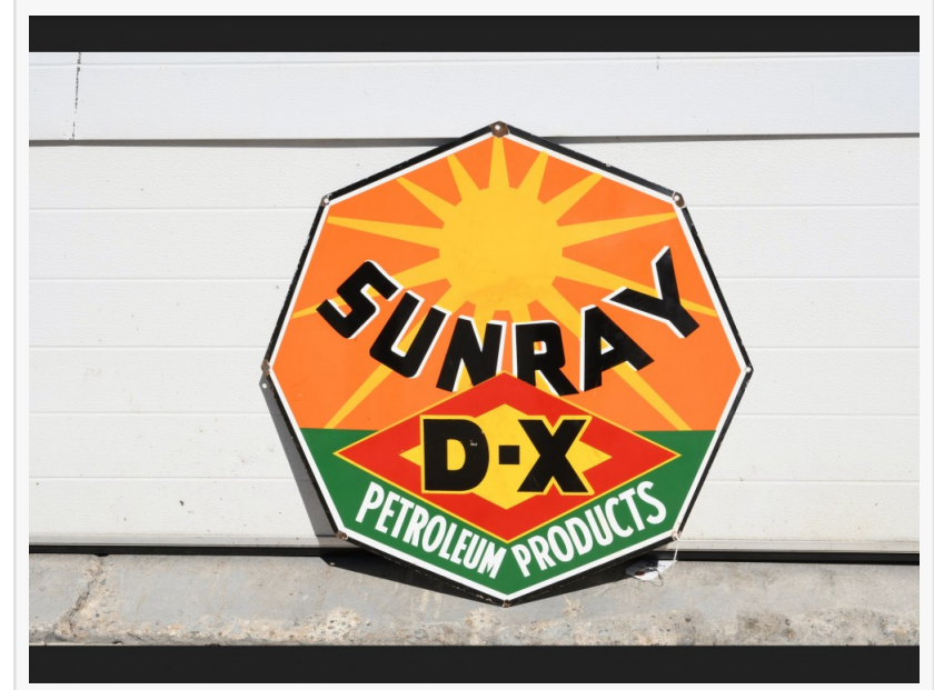
Sunray D-X Petroleum Products sign, 27 inches square.

but has good colors and gloss and measures 42 inches square.