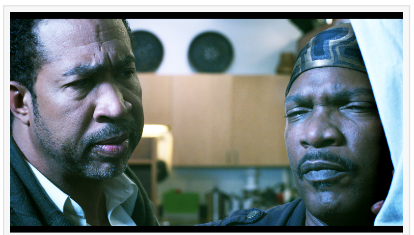
THE LAST REVOLUTIONARY - Opening Night Film ADIFF 2017

NEW YORK, NEW YORK, UNITED STATES, November 10, 2017 /EINPresswire.com/ -- <u>The African</u> <u>Diaspora International Film Festival</u> (ADIFF) celebrates its 25th anniversary with a total of 64 films from 31 countries including 31 World, US and NY Premieres. Screenings will be held in three venues in Manhattan: Teachers College, Columbia University, Cinema Village and MIST Harlem.