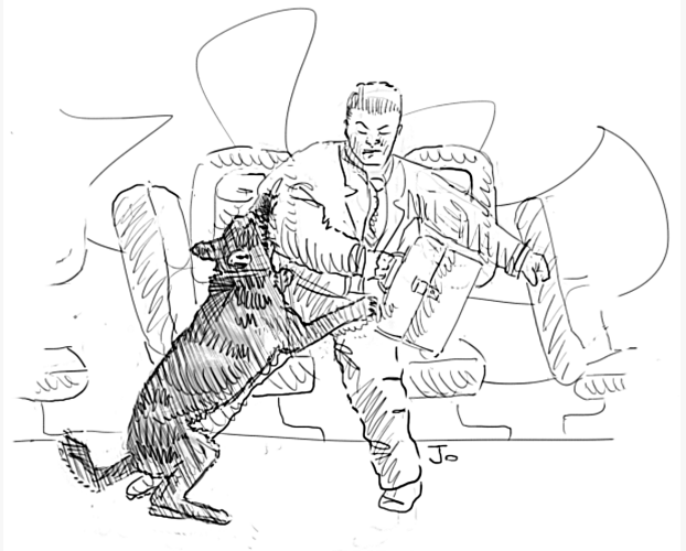
Rick attacks a dangerous drug boss. (Line drawing by Joe Hanrahan)