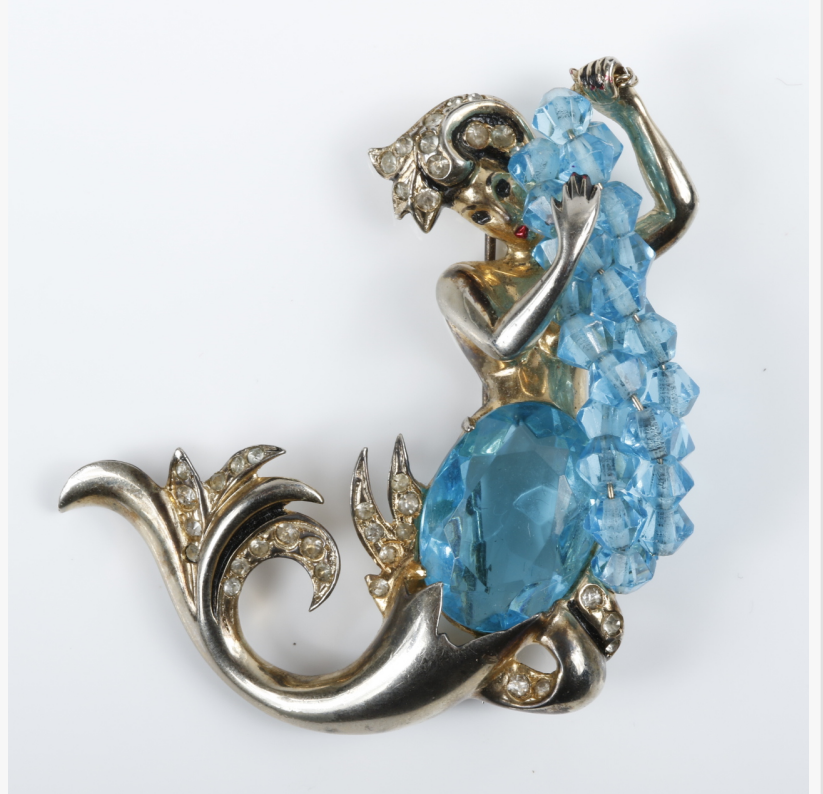
Eisenberg sterling vermeil mermaid figural pin brooch with blue crystal jewels.