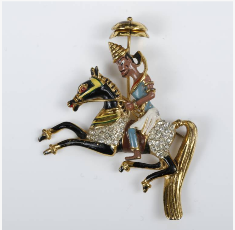
Coro Craft (Corocraft) 'Adolph Katz' sterling vermeil Persian man on horseback pin brooch.