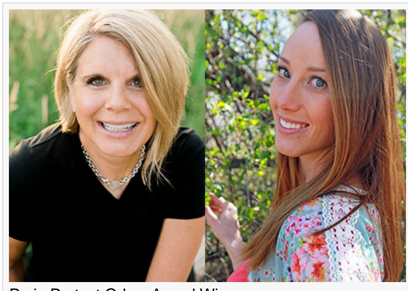
Perio Protect Orkos Award Winners

Patients who are anxious about dental care often ignore early signs and symptoms of gum disease, like bleeding gums and bad breath, because the gums don't hurt yet. When the disease advances to the point of discomfort, it is