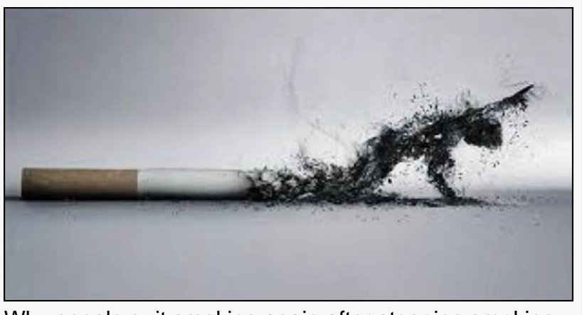
Why people quit smoking again after stopping smoking with hypnotherapy

The positive suggestions used to get people to <u>quit smoking</u> are a wonderful thing. They go in a smoker, an hour and