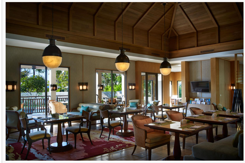
A cozy Club Lounge at The Ritz-Carlton, Bali

Exclusive benefits include unlimited access to the stylish Club Lounge – a secluded sanctuary nestled into the heart of the resort. A dedicated Club Concierge is on hand to take care of your individual needs, whether reserving the best table at your favorite restaurant, booking a signature spa treatment or confirming your onward travel arrangements. Fringed by frangipani trees, the private swimming pool creates