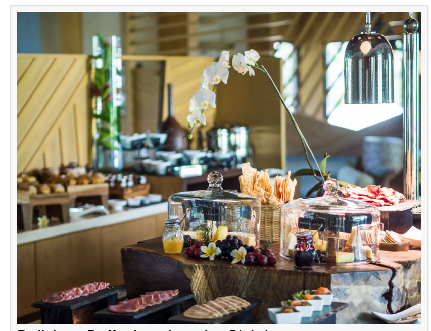
Delicious Buffet Lunch at the Club Lounge

Cuisine is another highlight of The Ritz-Carlton Club® Experience, with guests invited to start their day with complimentary coffee served in their suite at wake up call, followed by a gourmet buffet breakfast and Chef's a la carte suggestions at the Club Lounge. Light lunches and afternoon tea with all the trimmings are served during the day, while balmy Bali evenings are ushered in with hors d'oeuvres and poolside sundowners, with a choice of house spirits, wine and beer. An exquisite dessert buffet - including a chocolate dip - will end your evening on the sweetest of notes. Club quests may also gain a fascinating insight into Balinese culture on Sunday afternoons, with the opportunity to make canang, traditional Balinese flower offerings.