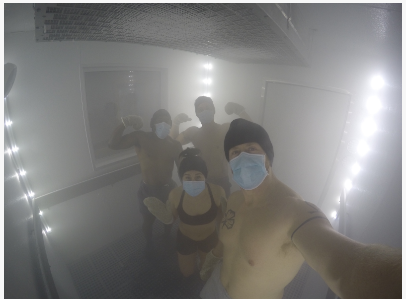
Plenty of room to move and recover together