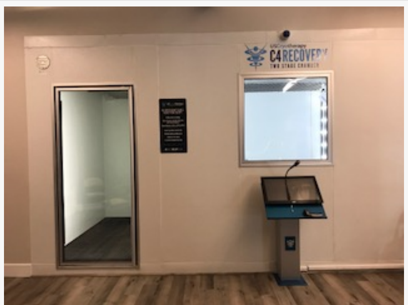
Cryo with friends and family

About US Cryotherapy: US Cryotherapy™ is a cold air therapy & equipment company based in the Sacramento, CA area. They operate Company owned wellness and recovery centers in Roseville and Davis, CA, Scottsdale AZ, and Redondo Beach CA (at Velocity Sports Performance). The Franchising Division currently has 13 open locations with various new centers opening around the country throughout 2017. US Cryotherapy introduced Whole Body Cryotherapy (WBC) to the United States creating the market in 2011, was the first and remains the only company offering whole body,