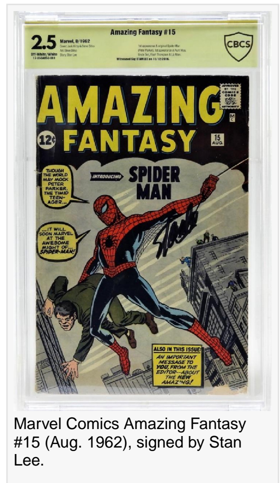
Marvel Comics Amazing Fantasy #15 (Aug. 1962), signed by Stan Lee.

A strong candidate for top lot of the auction promises to be the copy of Marvel Comics Amazing Fantasy issue #15 (Aug. 1962), signed by legendary comic illustrator Stan Lee and witnessed on Nov. 12, 2016. (est. $8,000-$12,000). The book, graded CBCS 2.5, featured the first appearance and the origin of Spider-Man, along with Aunt May, Uncle Ben, Flash Thompson and Liz Allen.