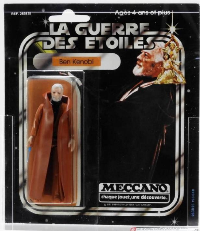
French 1978 Meccano Star Wars 20 Back Ben Obi-Wan Kenobi figure, AFA 85.