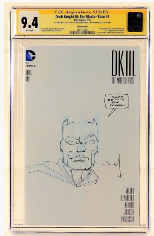
Frank Miller's blank variant sketch of Batman in bust, drawn with cowl and cape.

Individual comics will feature a copy of Marvel Comics X-Men issue #1 (Sept. 1963), with the first appearance of Magneto and the X-Men, and the X-Men’s origin, signed by Stan Lee with a