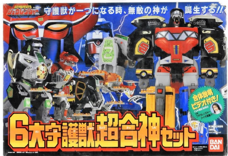
1992 Bandai Megazord and Dragonzord gift set, made in Japan, factory sealed