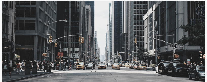
Friendly TLC Rentals & Leasing