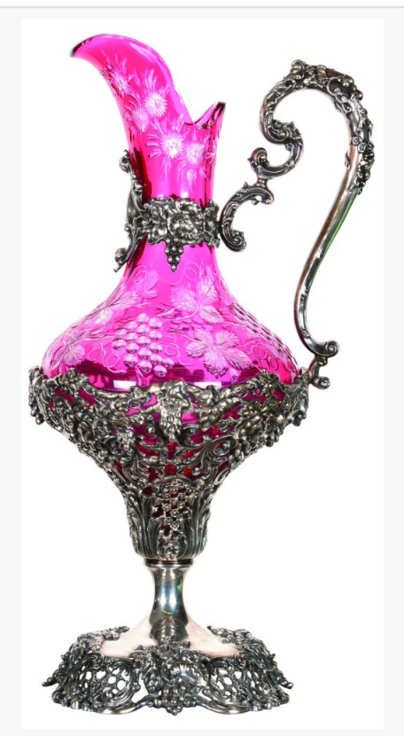
Museum-quality cranberry cut to clear Dorflinger ewer, 17 inches tall.

A two-decanter set in the Mercedes pattern by Clark with facet-cut goose neck, both having a hobstar base and pattern cut stoppers, one having a pattern cut handle, will come under the gavel. Also sold will be an ice cream tray, signed Sinclaire in the Stars and Stripes pattern, boasting a superior quality blank.