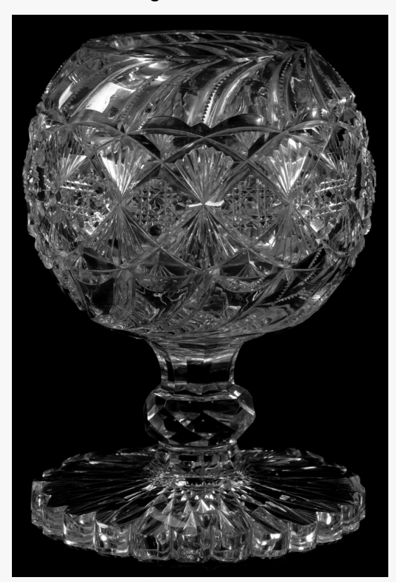
Exceptional pedestal rose bowl in the Croesus pattern by J. Hoare, with heavy blank.