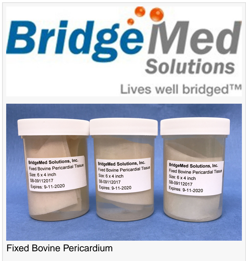
Fixed Bovine Pericardium

Apart from tissue patches, BridgeMed Solutions also provides end-to-end services contract manufacturing for TAVR, TMVR, Tricuspid and Pulmonic Valves . As part of the consulting services , the company provides disease monitoring, tissue