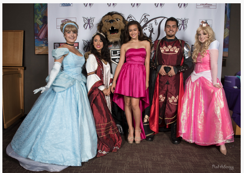
Medieval Times and Los Angeles Kings