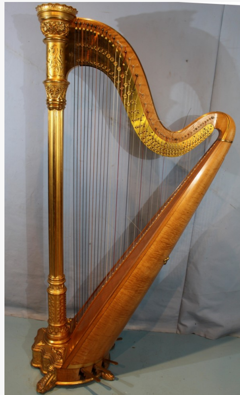
Lyon & Healy harp with original shipping crate dated 1894 in Chicago.