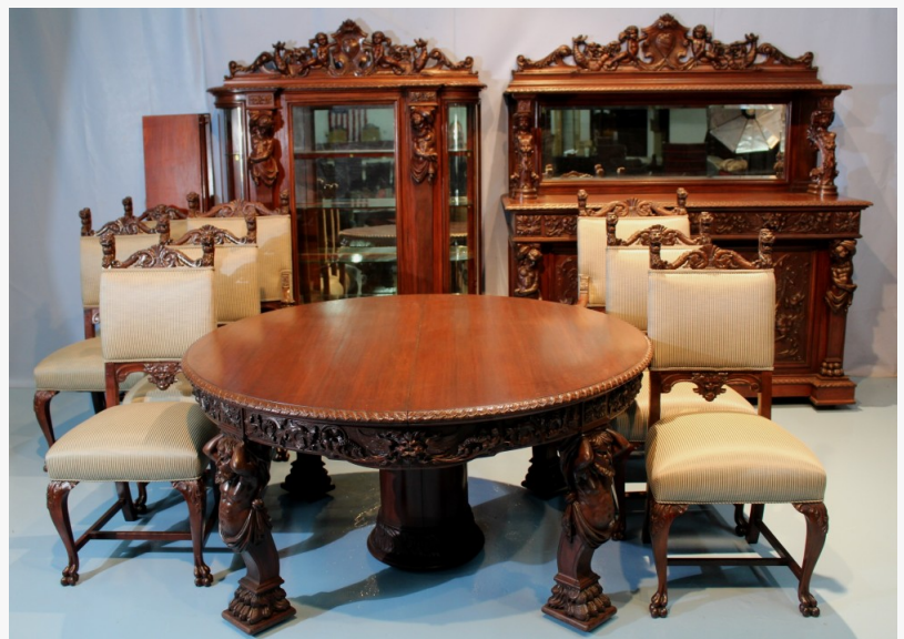
Magnificent 19th century 11-piece R. J. Horner dining room suite.