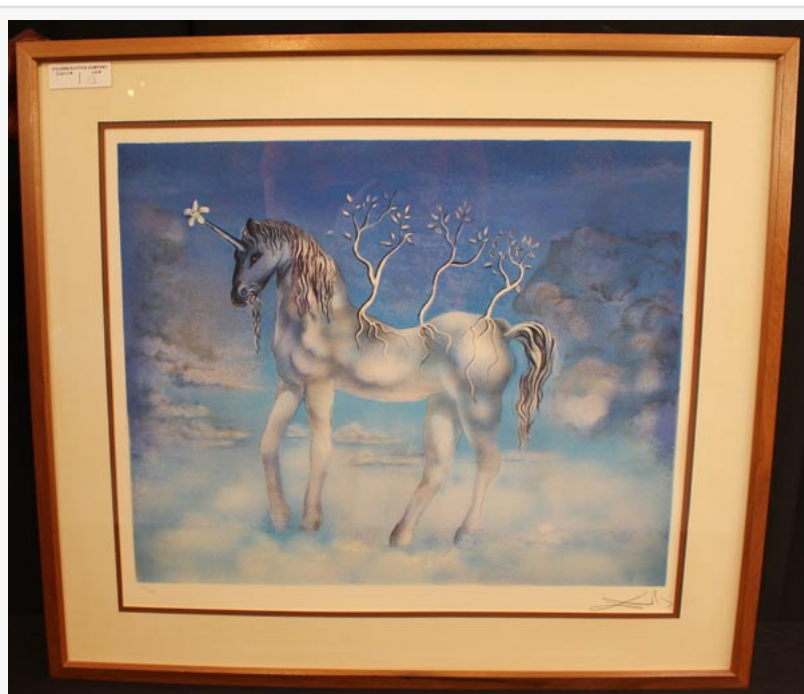
Lithograph signed and numbered by the renowned surrealist Salvador Dali.

They're just a few of the expected top earners in Stevens Auction Company's annual fall multi-estate auction, a two-day event planned for Friday, October 6th, from 5-8 pm (Central time) and Saturday, October 7th, starting at 9 am. The sale will be held in Stevens' gallery, located at 609 North Meridian Street in Aberdeen. Internet bidding will be provided by LiveAuctioneers.com .