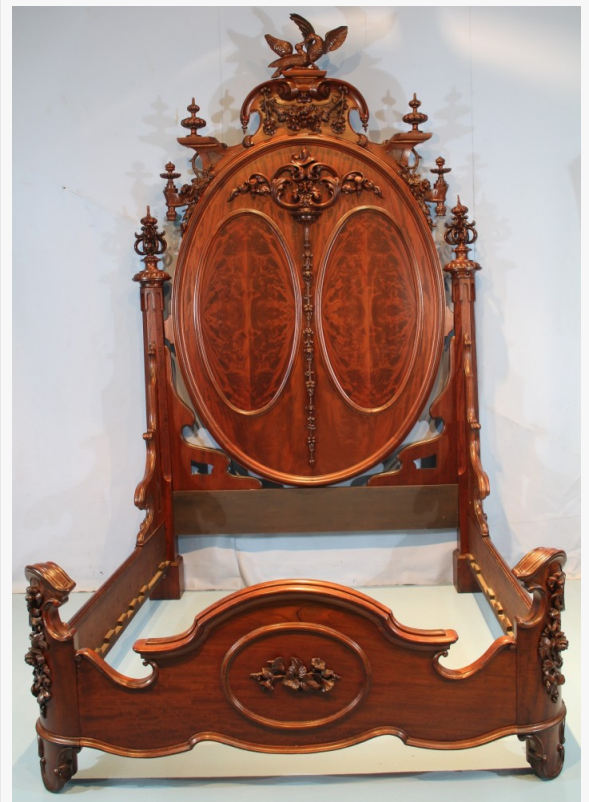
Mitchell & Rammelsberg Lincoln bed featuring a high back and eagle crown.