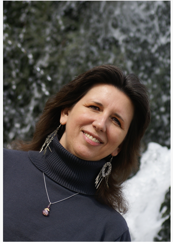
Tapping in to Magic and Miracles: The Astounding Importance of Putting Yourself First