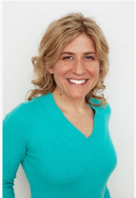
Why Moving Away from Joy is the Key to It