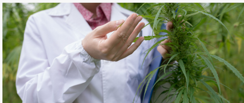
Lab Scientist Examining Cannabis

States up and down the West Coast (including Alaska) have enacted laws expanding the medical marijuana laws to permit sales of cannabis for purely recreational purposes. This is not just a West Coast phenomenon: voters in a couple of East Coast states (Maine and Massachusetts) recently approved ballot measures allowing retail sales of cannabis for recreational use in their jurisdictions as well.