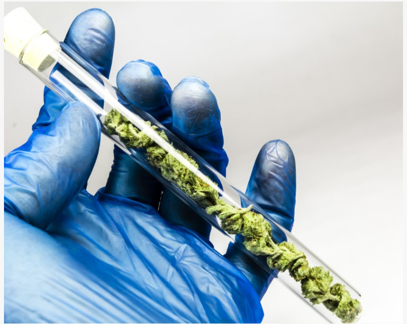
Testing Medical Marijuana