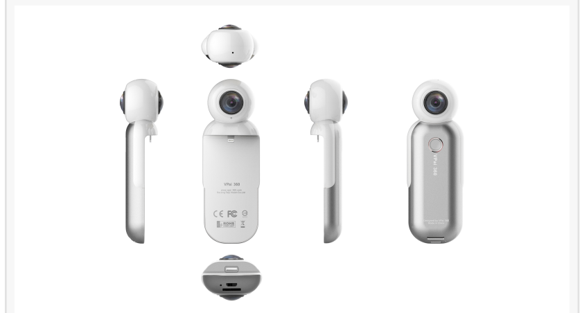
VPai Slide - 360 Camera

This press release can be viewed online at: http://www.einpresswire.com