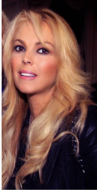
Dina Lohan

"Chagall: Fantasies for the Stage" here, is outstanding, and a must see. Focusing on Chagall's work