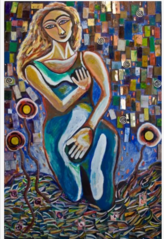
Image: Moira Cue; Solitude; 1992, Acrylic on Masonite (Private Collection)