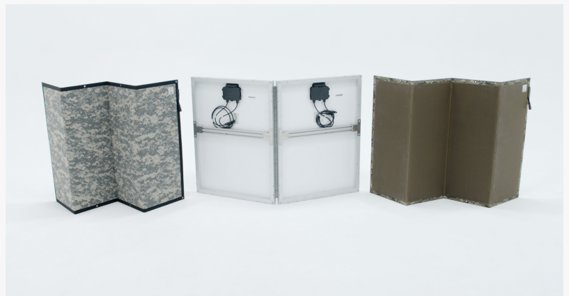
Military Spec Panel Thickness Comparison with Traditional Panels