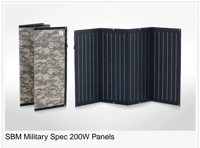
SBM Military Spec 200W Panels