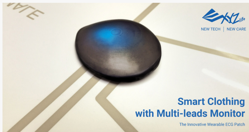
Smart Clothing with Multi-leads Monitor