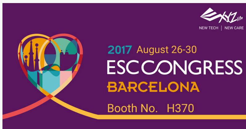
Welcome to Booth H370 during ESC Congress 2017