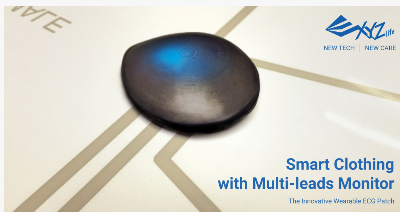
Smart Clothing with Multi-leads Monitor