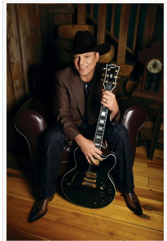
John Michael Montgomery

The Badlands Amp will be filled with his classic tunes such as "Life's a Dance", "I Swear", "I Love the Way You Love Me", and "I Can Love You Like That". His song "Sold (The Grundy County Auction)", will have the audience dancing in the isles.