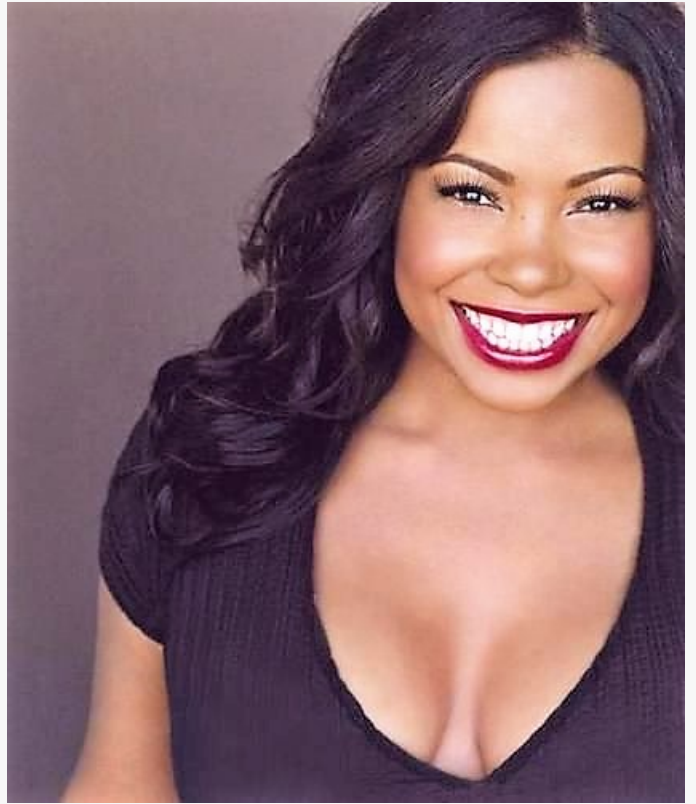
Award-winning actress Paula Jai Parker, a native of Cleveland, Ohio, plays Ms. Kelly in Hey Mr. Postman which shoots in Cleveland in late summer 2017.