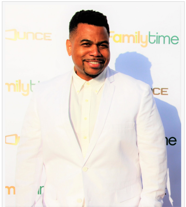
Omar Gooding who plays Mack in Hey Mr. Postman is a quadruple threat in the entertainment industry as an actor, rapper, producer, and owner of Modo Entertainment TV Network.