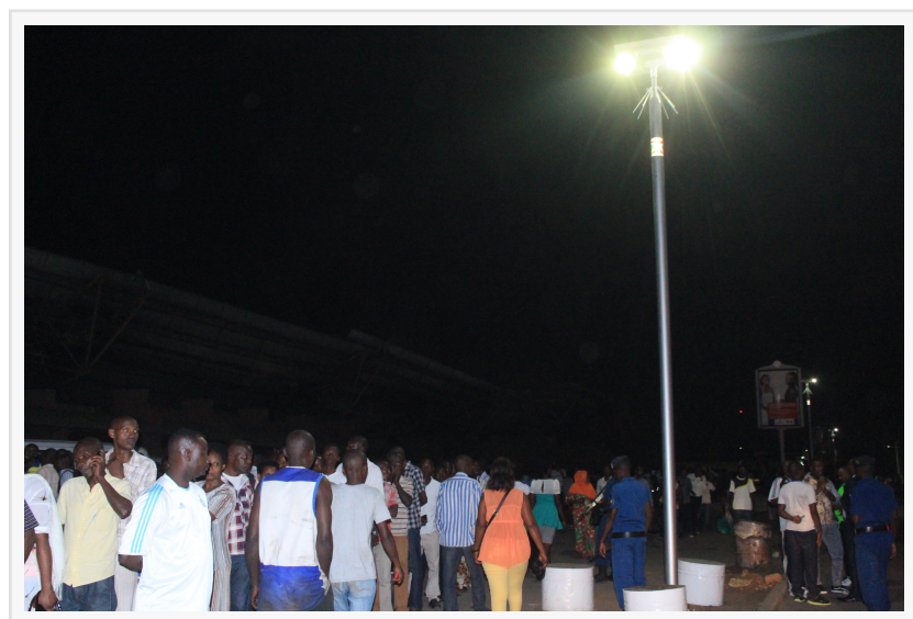
Gigawatt Global launches its off-grid program in Africa, starting in Bujumbura

This week solar-powered "light islands" began appearing in the heavily-trafficked central bus station and nearby marketplace, extending commercial hours and personal safety.