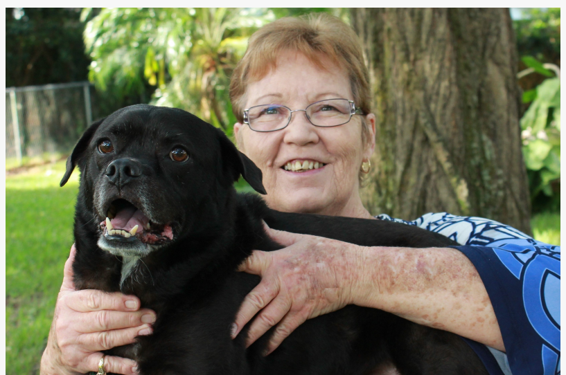
Buckey and his mom, together forever thanks to Fairy Tail Endings of Florida and a Grey Muzzle grant.

The national nonprofit The Grey Muzzle Organization improves the lives of at-risk senior dogs by providing funding and resources to animal shelters, rescue organizations, sanctuaries, and other nonprofit groups nationwide.