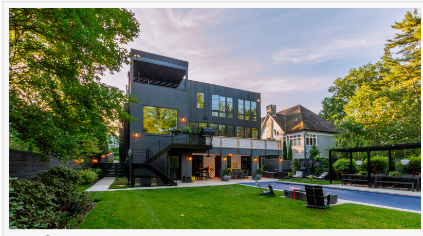
MATSU shou sugi ban accoya

The Bethesda residence is minimalist with a single tree and a trellis supporting ivy against the MATSU cladded garage. Continuing around the garage towards the back yard, a hidden garden is found among the shou sugi ban Accoya®, and the garden includes a fountain, sitting