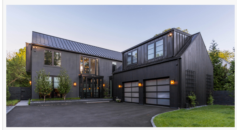
MATSU shou sugi ban accoya

area, and succulents. While the gray accents and large wall of charred black wood are the main features of the back of the house, a large porch area, a pergola, a large yard, and a pool add a classic suburb feel to the back yard.