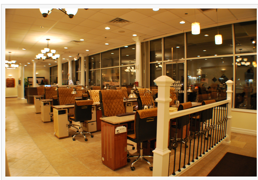
Nail & Hair Care Spa earns second Spectrum Award for Customer Satisfaction

In partnership with The Stirling Center for Excellence, CBN recognizes businesses such as Nail & Hair Care Spa for providing an outstanding customer experience and honors them with the