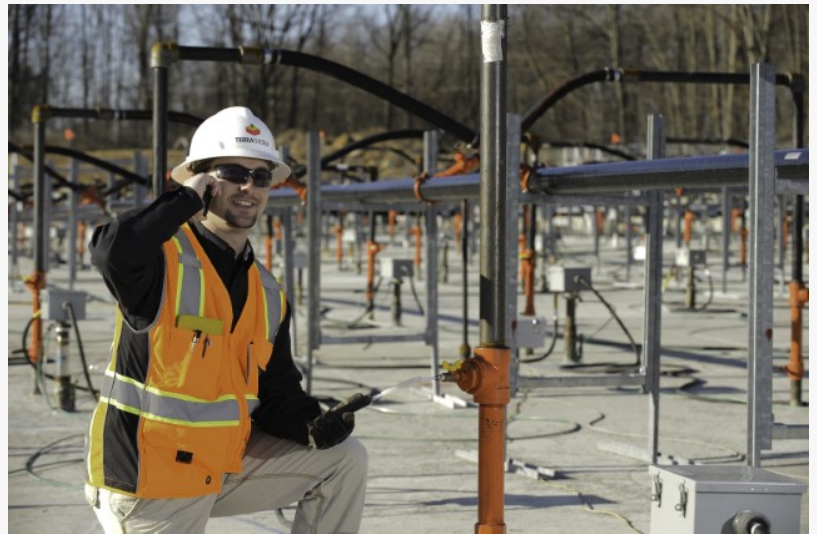
TerraTherm-Clean partnership brings thermal remediation technologies to Brazil.