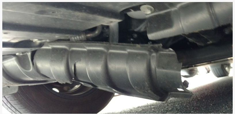
Under car damage surprise Avis check-in agent at Fort Myers Airport

"Yesterday, upon the anxiety-producing rental return in Fort Myers, there was no exception with my personal protection protocol," Howe continued. "What was unexpected -- and also a positive