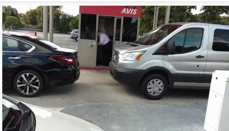
Avis, West Palm Beach International Airport